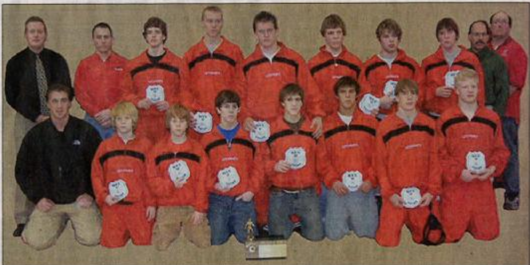
CLASS BB CHAMPS: Letchworth's wrestling team poses after its victory on Saturday in the Section 5 Class BB tournament at Caledonia-Mumford.